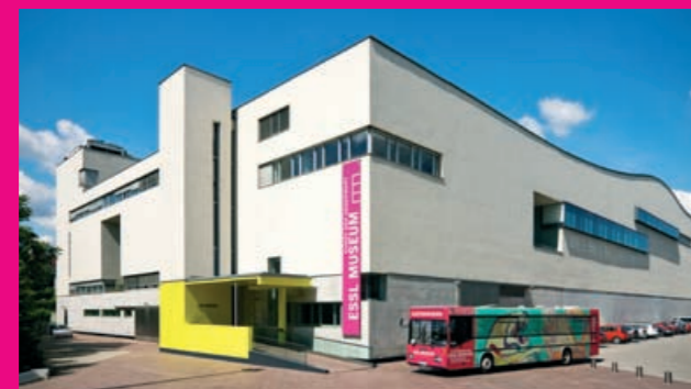
Essl Museum, 2010